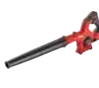
Order No. 472913 Cordless fan BW 18.0-EC