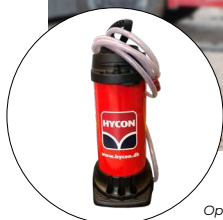
Optional Dust suppression kit Item no. 3030051

Contact us for more information: hycon@hycon.dk / +45 96 47 52 00