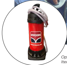
Optional Dust suppression kit Item no. 3030051

Contact us for more information: hycon@hycon.dk / +45 96 47 52 00