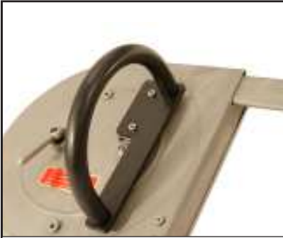
Knob or D-Handle