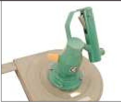
Motor with preventive starting lock