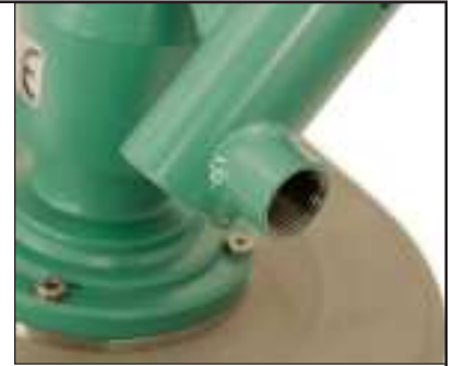
Pneumatic, hydraulic or electric type