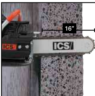
Deep cutting solution for obstructed or small openings