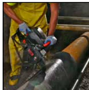
Safer to cut ductile iron