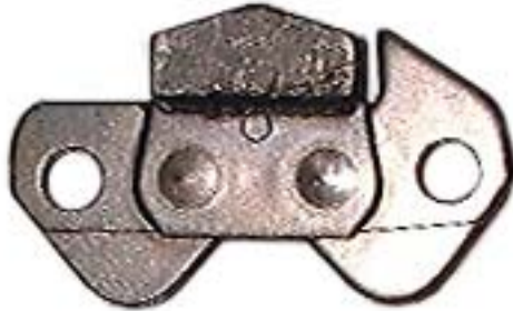
Pinnacle Saw Chain Segment